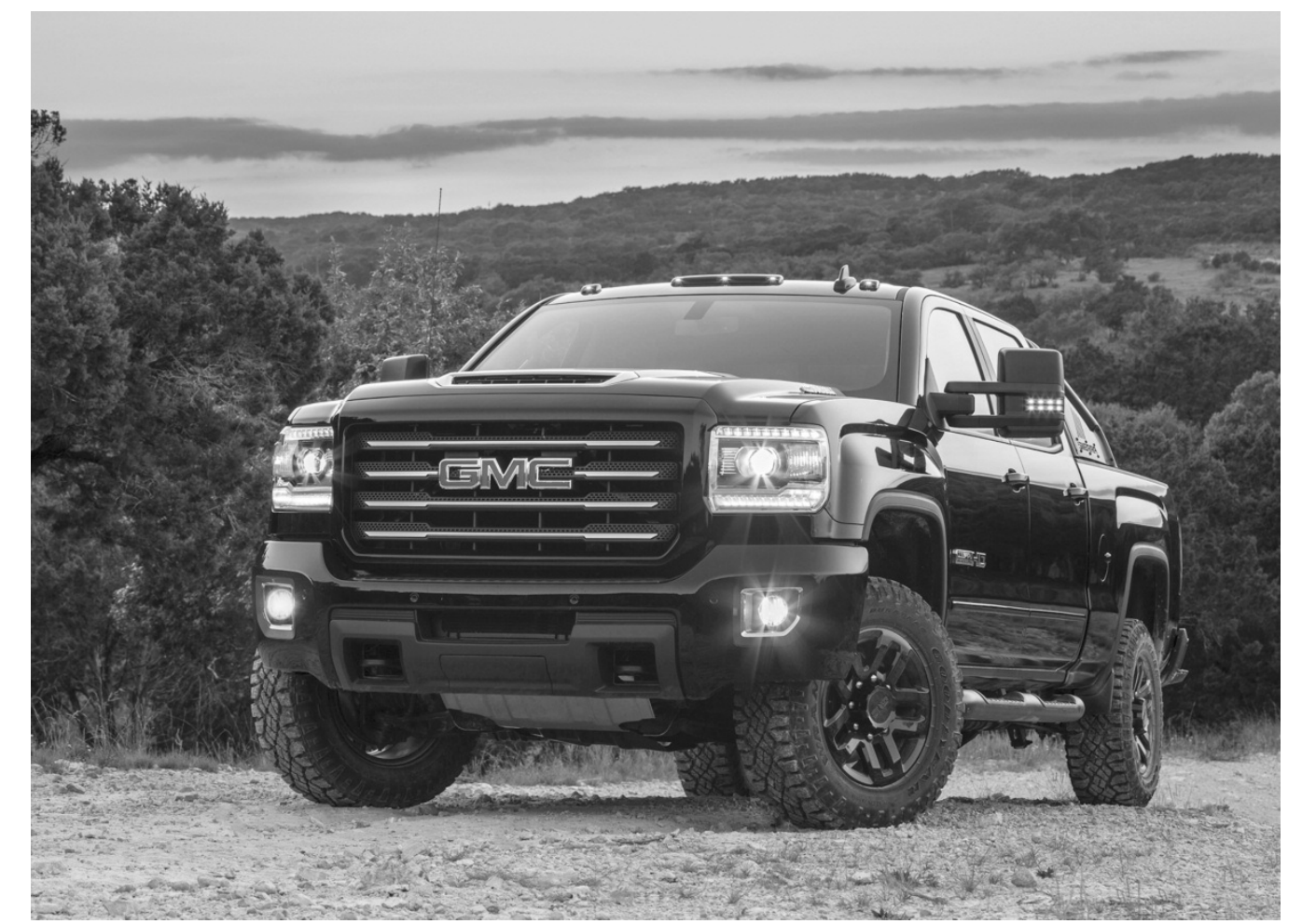
GMC has introduced the 2017 Sierra HD All Terrain X, the most off-road-capable model in the Sierra HD lineup, and one that matches its enhanced capability with trail-ready style and the brand's signature refinement.

The All Terrain X's customized appearance blends a premium package of mono-