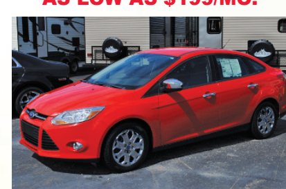
2012 FORD FOCUS SE Only 84 K, 4 cyl, 38 MPG.