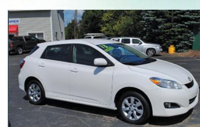
2013 TOYOTA MATRIX S AWD, HATCHBACK. VERY NICE. AS LOW AS $199/MO.