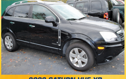
2009 SATURN VUE XR AWD, power moonroof. AS LOW AS $239/MO.