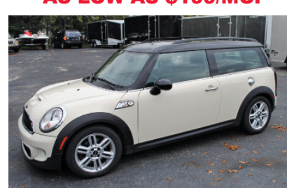
2011 MINI COOPER S Leather, dual moonroof. Very cool car. AS LOW AS $249/MO.