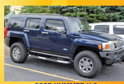
2007 HUMMER H-3 Leather, tow pkg, 4x4, navigation. Very nice. AS LOW AS $299/MO.